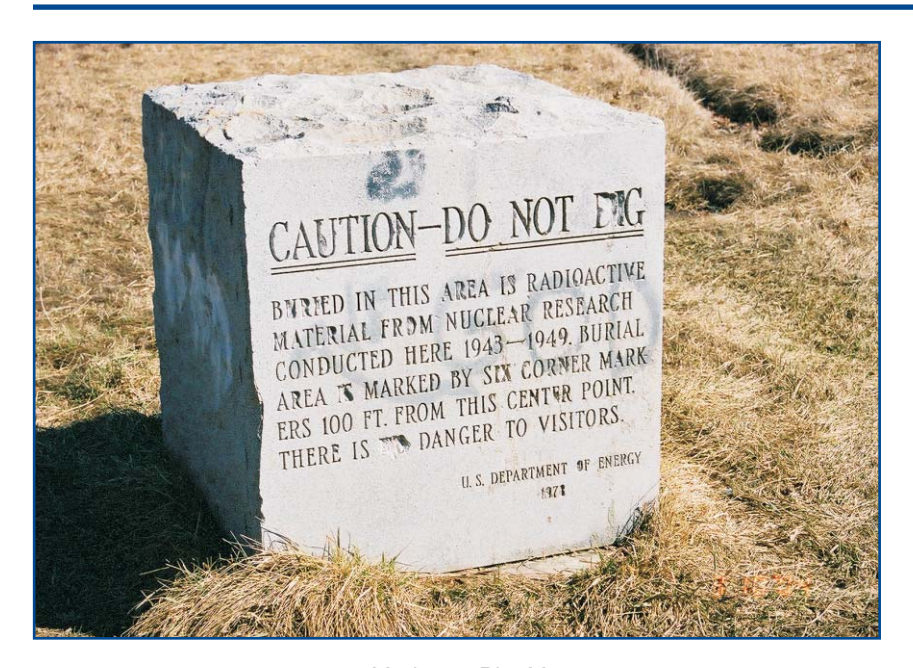
Marker at Plot M

concrete-filled shell of CP–3′ was buried by excavating around it on three sides and detonating strategically placed explosives in the earthen "pedestal" supporting it. The reactor shell rolled and ended upside down in the excavation. The buildings that housed the reactors were demolished. The concrete shield of CP–2, the only remaining portion of that reactor, was demolished with a wrecking crane and pushed into the excavation, which was then filled, leveled, and landscaped. By 1956, all buildings and equipment at Site A had been decontaminated and demolished.