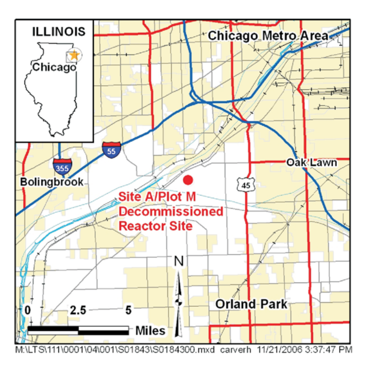
Location of the Site A/Plot M, Illinois, Decommissioned Reactor Site

Operations at Site A began in 1943 and ceased in 1954. The first nuclear reactor to achieve a self-sustaining chain reaction, CP-1, was moved from the University of Chicago to Site A in 1943 and renamed CP-2. A second reactor, CP-3, was constructed on the site in 1943. The fuel for both reactors was natural uranium (uranium in which the natural abundance of the isotopes uranium-234, uranium-235, and uranium-238 has not been altered). CP-3 was dismantled in January 1950 because of suspected corrosion of the aluminum cladding around some of the fuel rods. The natural uranium fuel in CP-3 was replaced with enriched uranium (uranium in which the amount of uranium-235 in the fuel has been increased from its naturally occurring abundance). The redesigned reactor, named CP-3' (CP-3 prime), became operational in May 1950.